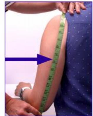
Mark upper arm length midpoint.