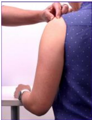
Mark spine extending from the shoulder (acromion process).

One half the distance between the acromion and the olecranon processes determines the midpoint of the arm.